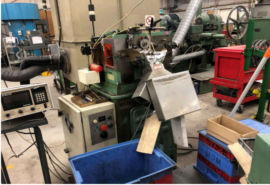
15 1999 Furnace Fixers Oven Model MKP-8C Good condition